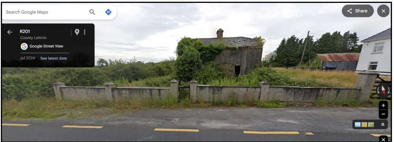
Fig 5: Street View image dated July 2024