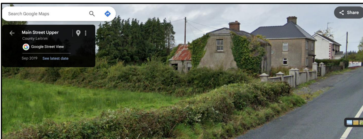
Fig 8: Street View image dated Sept 2019