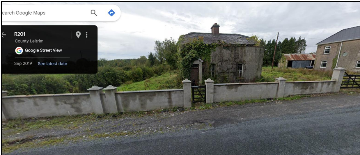
Fig 7: Street View image dated Sept 2019