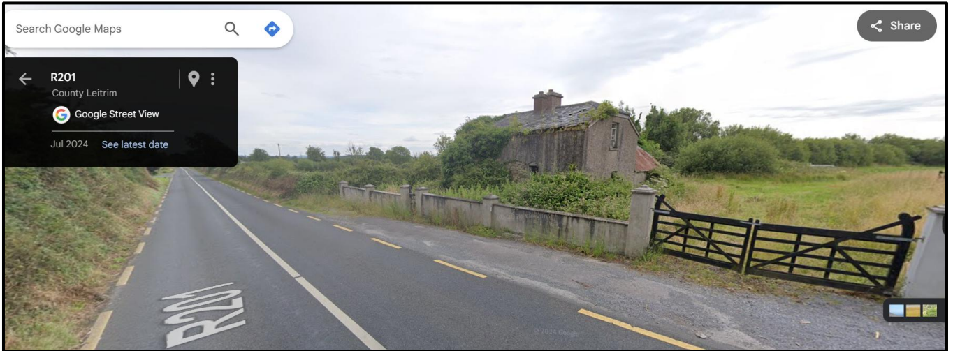
Fig 4: Street View image dated July 2024