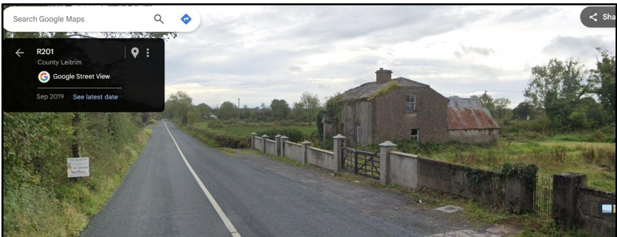
Fig 6: Street View image dated Sept 2019