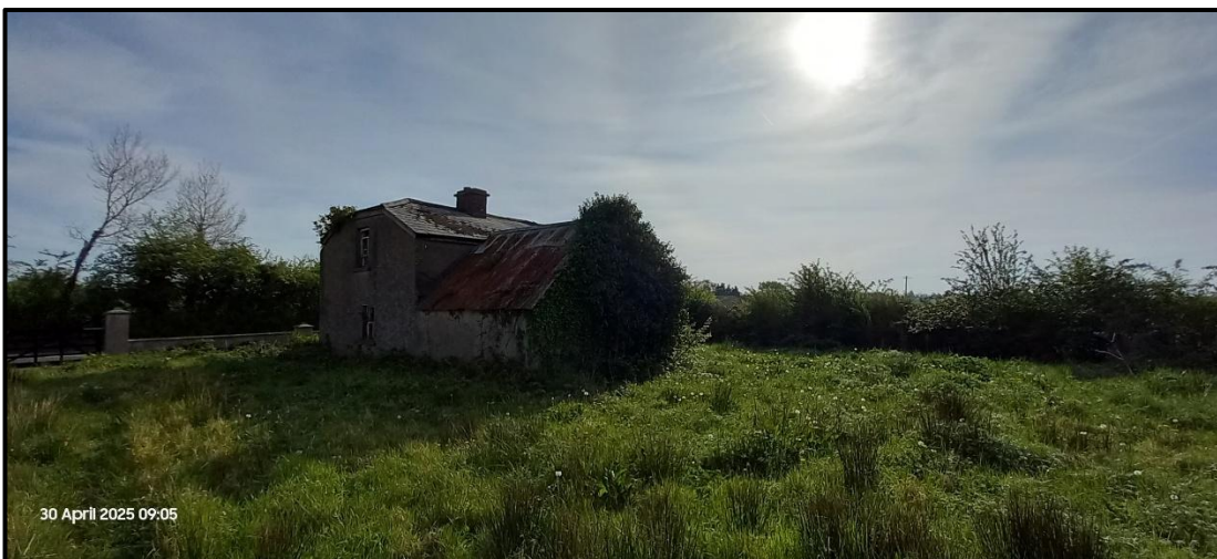
Fig 3: Rear & side elevation of subject property showing existing extension to be demolished