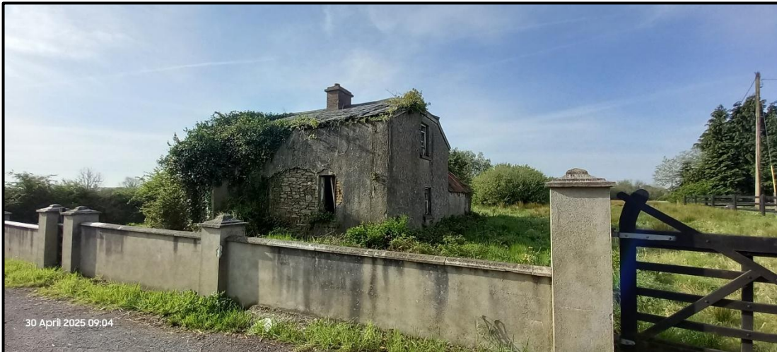
Fig 2: Front elevation of subject property