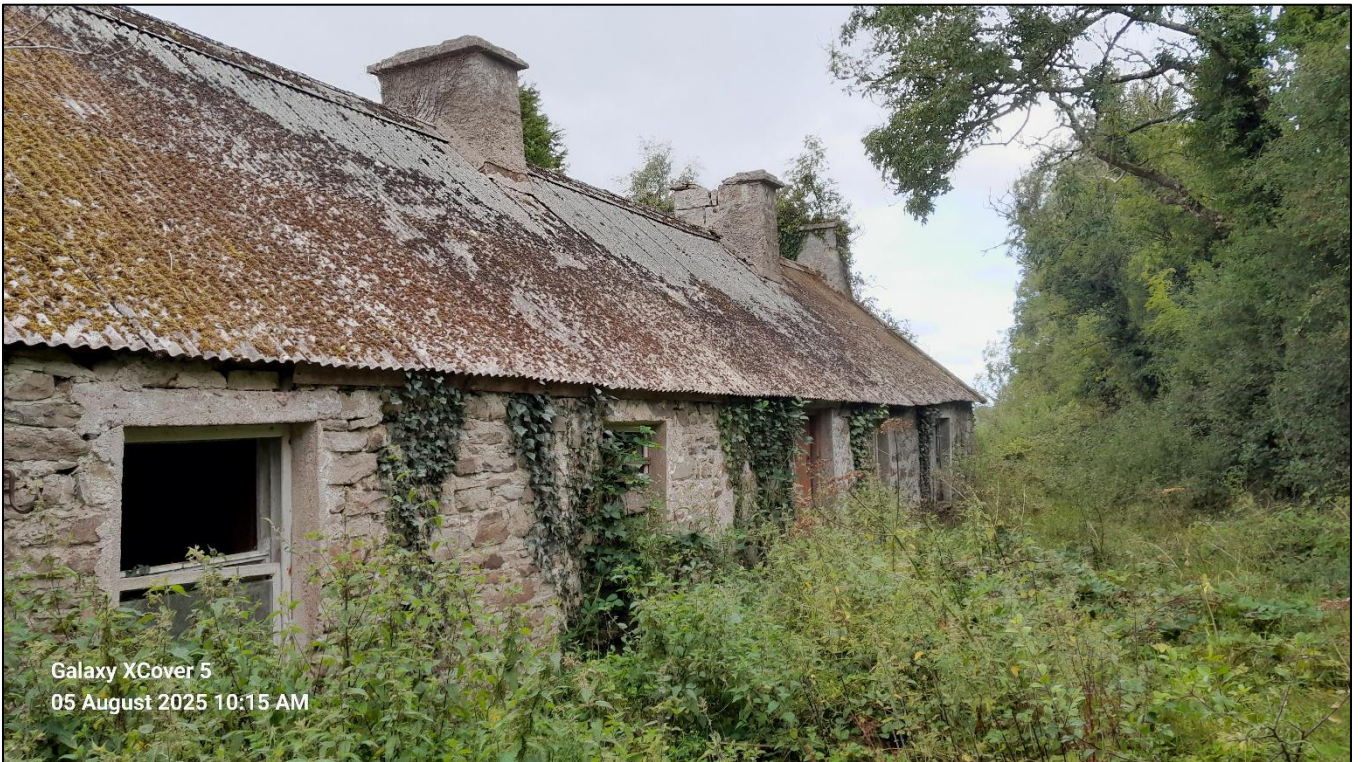
Fig. 2 – Image of rear of subject dwelling