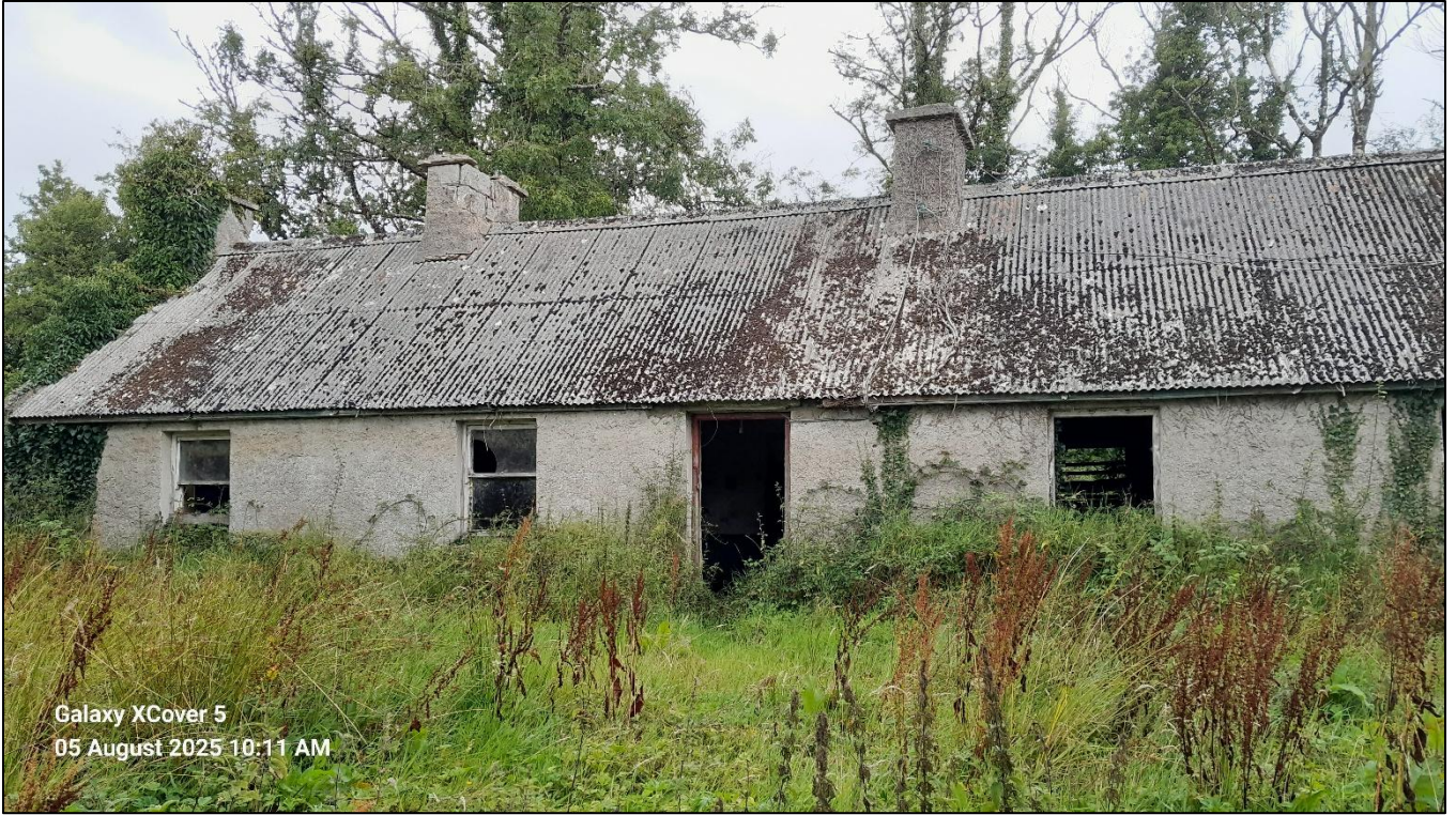
Fig. 1 – Image of front elevation of subject dwelling