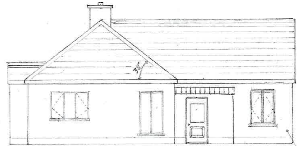
RIGHT ELEVATION SCALE 1:100

PROPOSED EXTENTION WITH TOTAL FLOOR AREA OF 38.75 m 2 FOR MR. KEVIN BYRNE, CLONCOOSE, MOHILL, CO. LEITRIM N41XN9