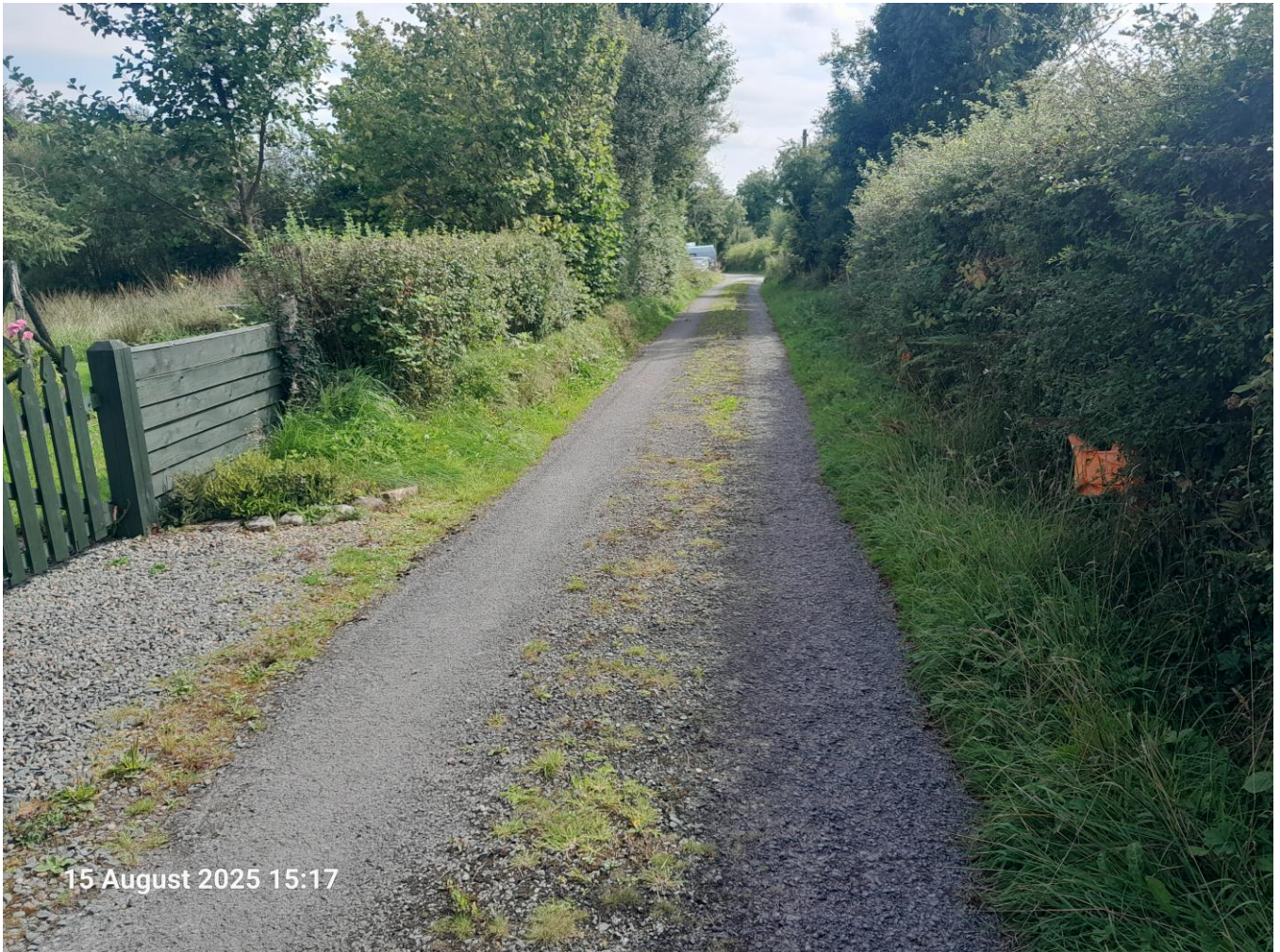
Fig. 1 – Image of L-15101 and location of proposed entrance (LHS)