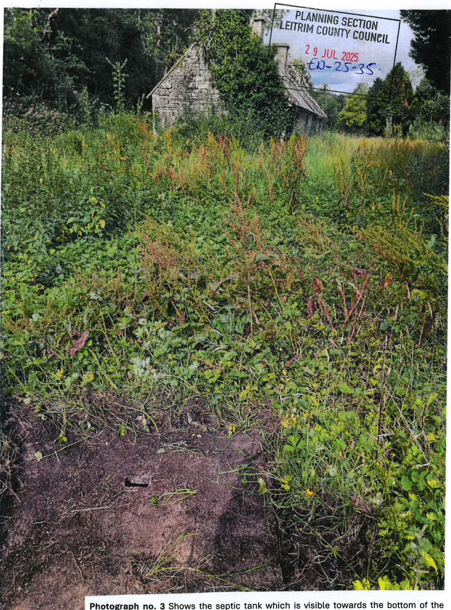
Photograph no. 3 Shows the septic tank which is visible towards the bottom of the photo. It is located to the left-hand side of the dwelling which is also visible towards the top of the photo.