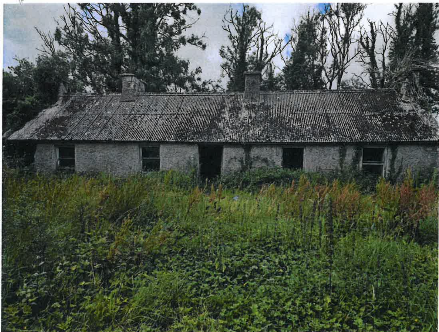
Photograph no. 1 Shows the front elevation of the dwelling.