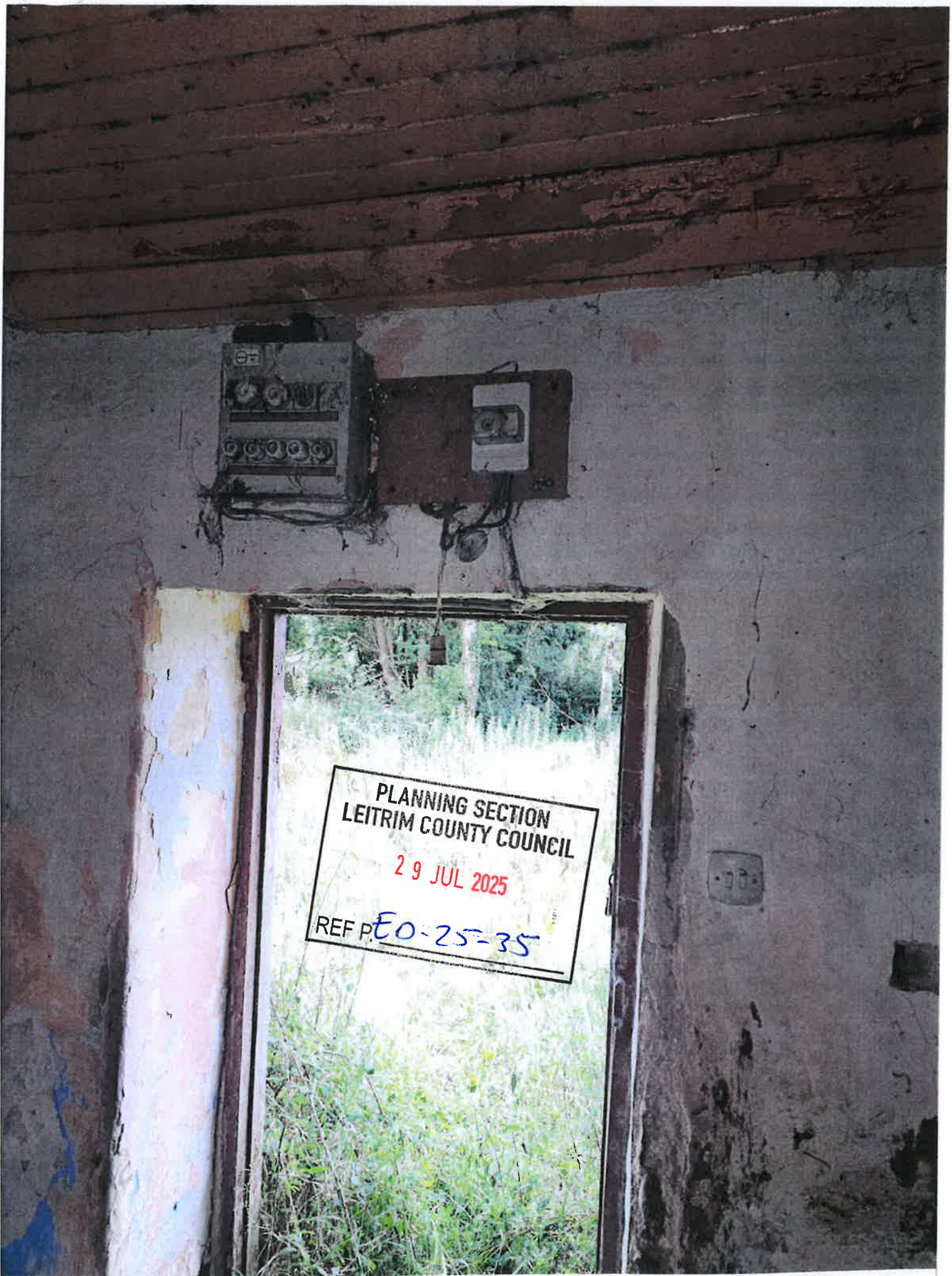
Photograph no. 4 Shows the fuse board over the front entrance door.