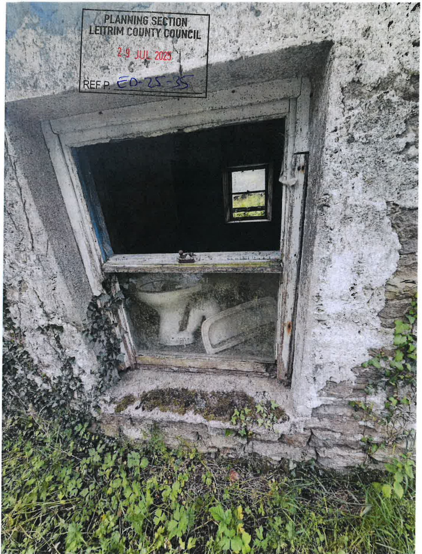
Photograph no. 5 Shows one of the rear windows when viewed externally.