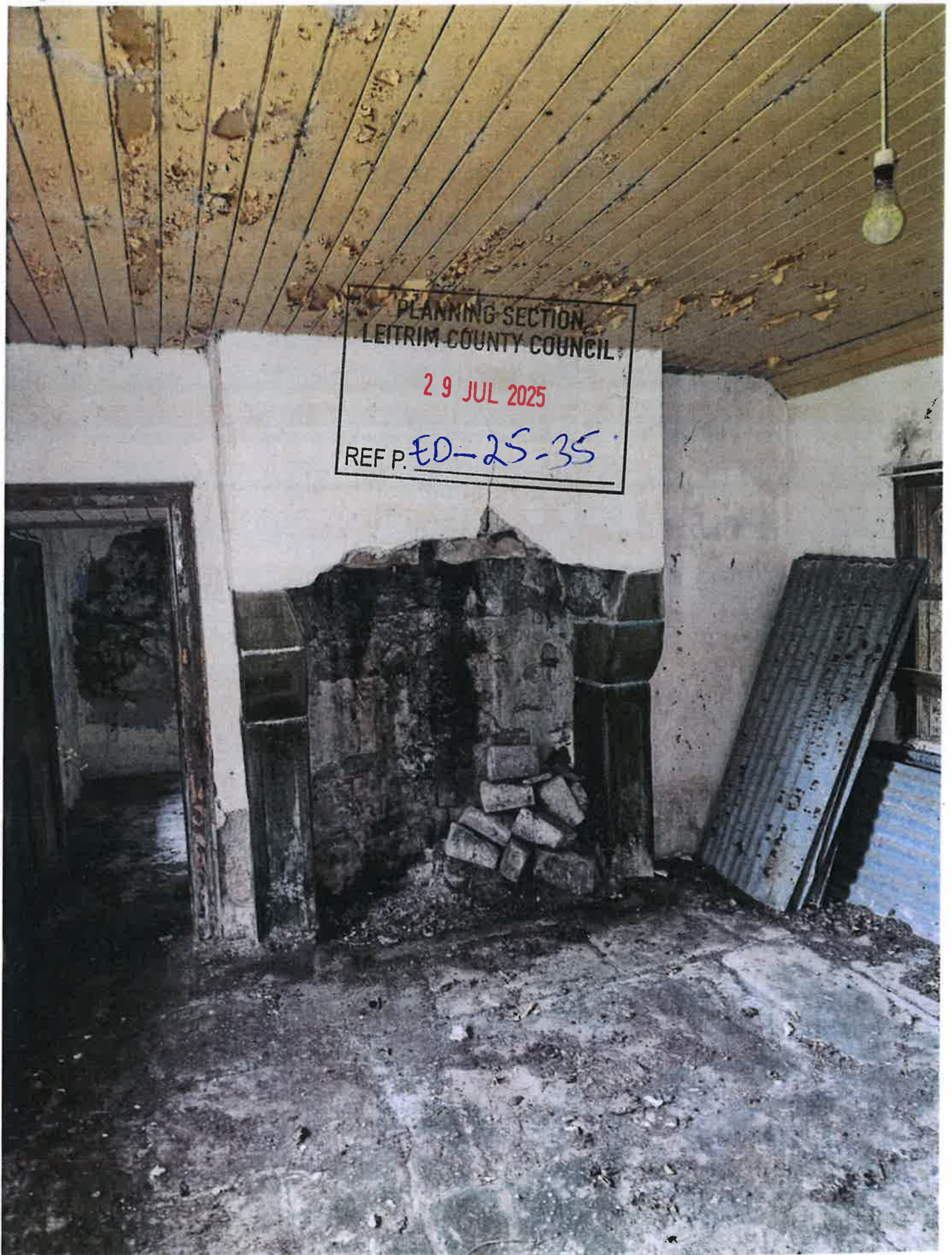
Photograph no. 7 Interior view of what we believe was the kitchen/living room.