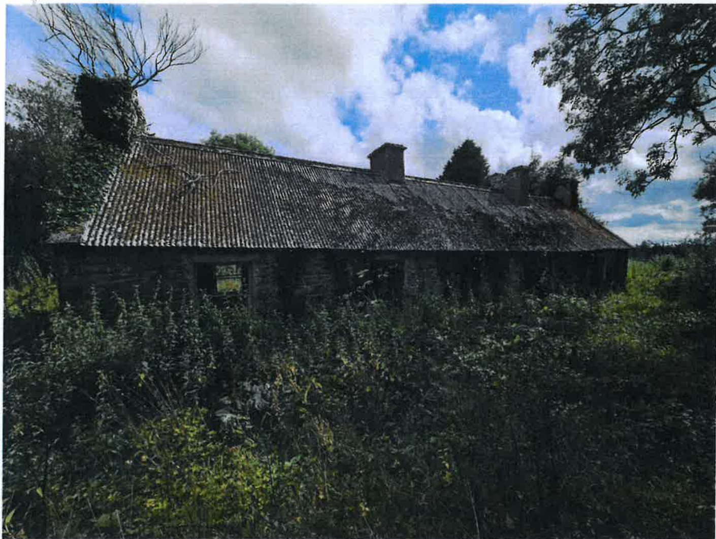
Photograph no. 2 Shows the rear elevation.