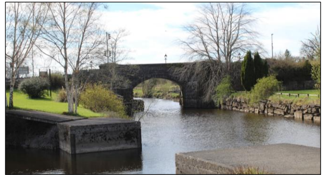
Photo of Leitrim Bridge in Winter 2025.