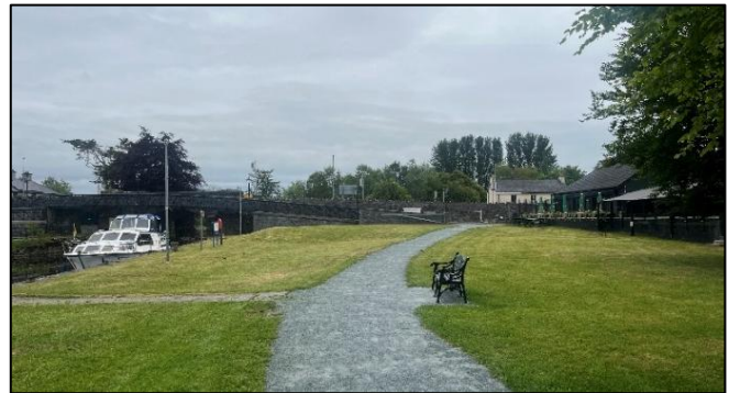
Photo In Park in Summer 2025.