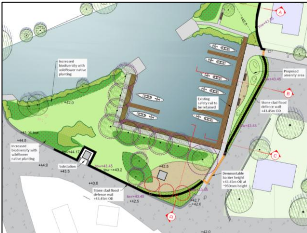
Draft scheme layout plan at the Leitrim Quay.