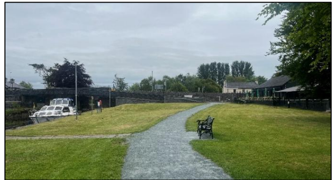
Photo In Bridge Park in Summer 2025.