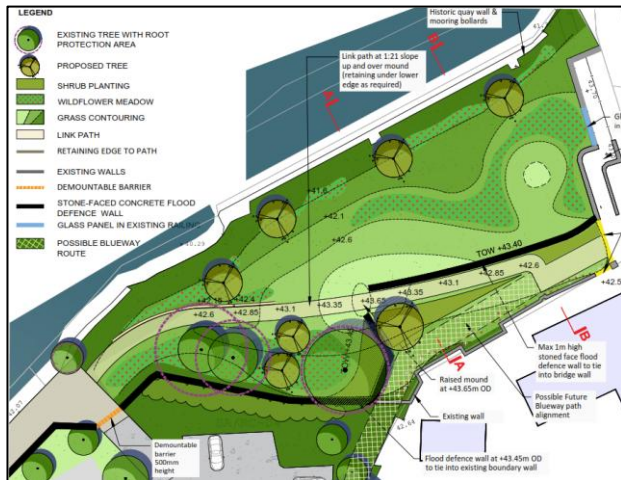
Draft scheme layout plan at the Bridge Park.