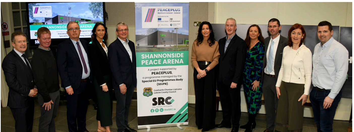
Representatives of the voluntary Shannonside Recreational Campus Committee

The facility will provide a safe and inclusive environment where people of all ages and abilities can come together – whether to train, compete, take part in wellness programmes, or simply enjoy being active as part of a community. By combining world-class facilities with a strong ethos of inclusion, the Peace Arena will stand as a symbol of what collaboration and vision can achieve. It is a lasting investment in the health, vitality, and future of Leitrim and the Shannonside region, and a legacy that will benefit generations to come.