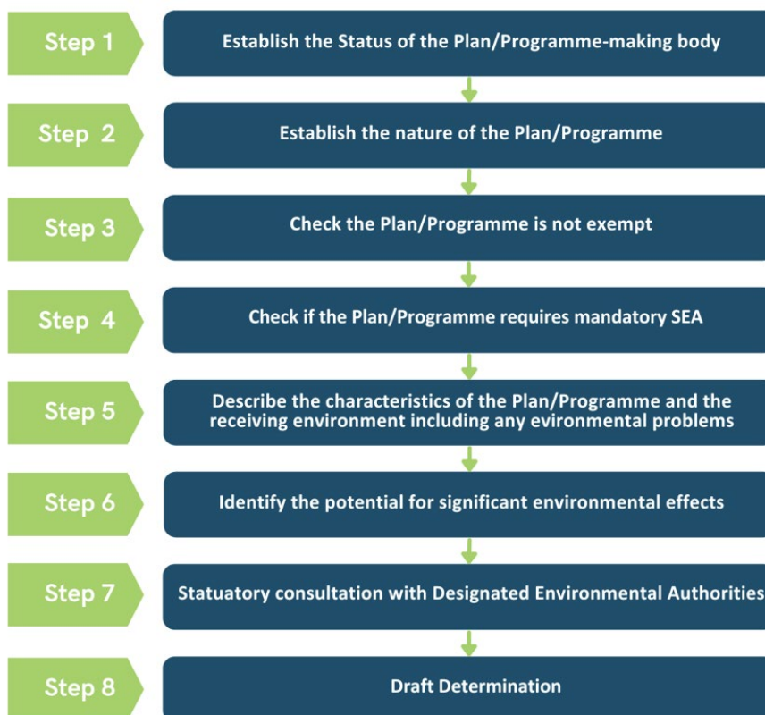
Figure 2-1: SEA Screening steps as per the EPAs Good Practice Guidance on SEA Screening